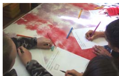
Figure 2. Children completing evaluation sheets

After both game had been played, the children sat at a table to complete a paper evaluation sheet (Figure 2).